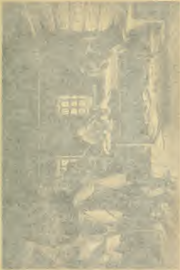
Photograph taken during the Advance or Retreat Headquarters on the Old Kaluga Road.