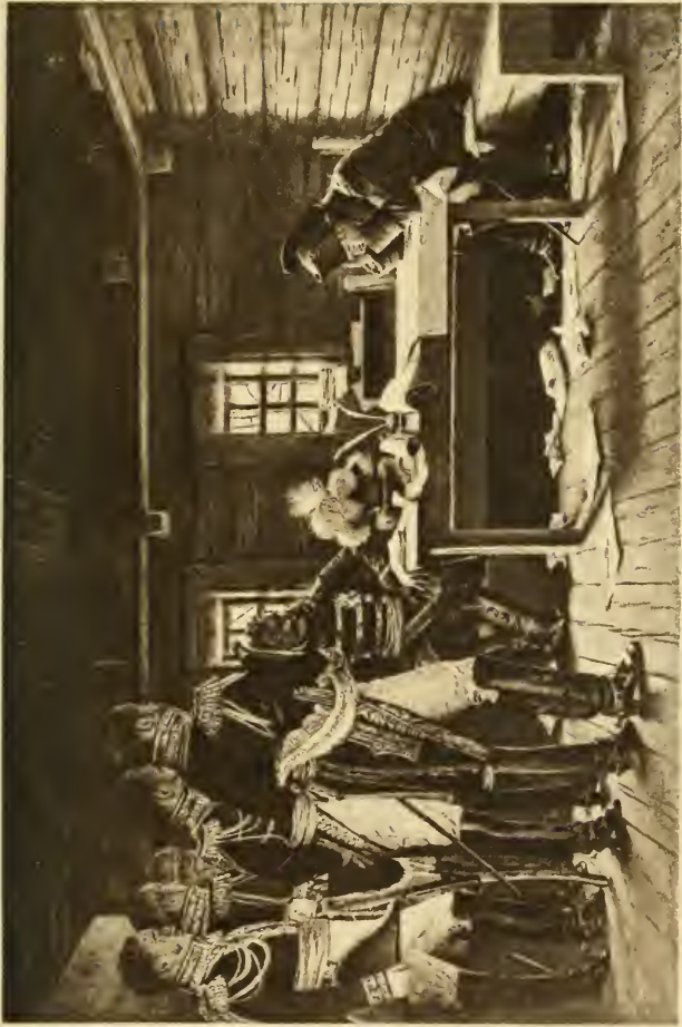
Photograph 1877 by the expedition of the United States. By permission of the American Anthropological Society.