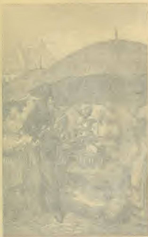
Russian soldiers in Paris, 1814 Engraving from Album of the War