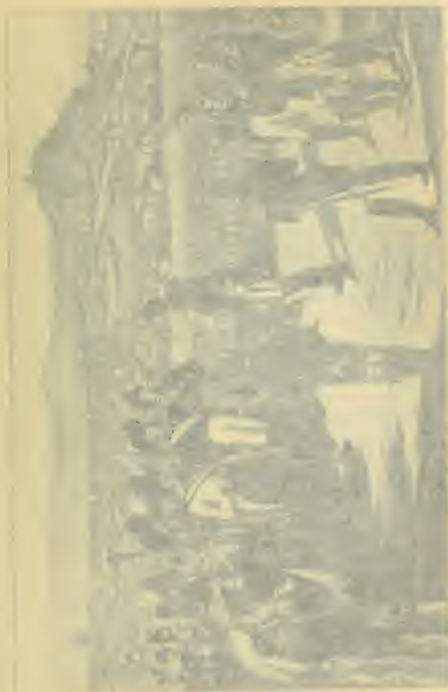
Capitulation of Paris, 1814 The Surrender of Paris to the Allies, 1814