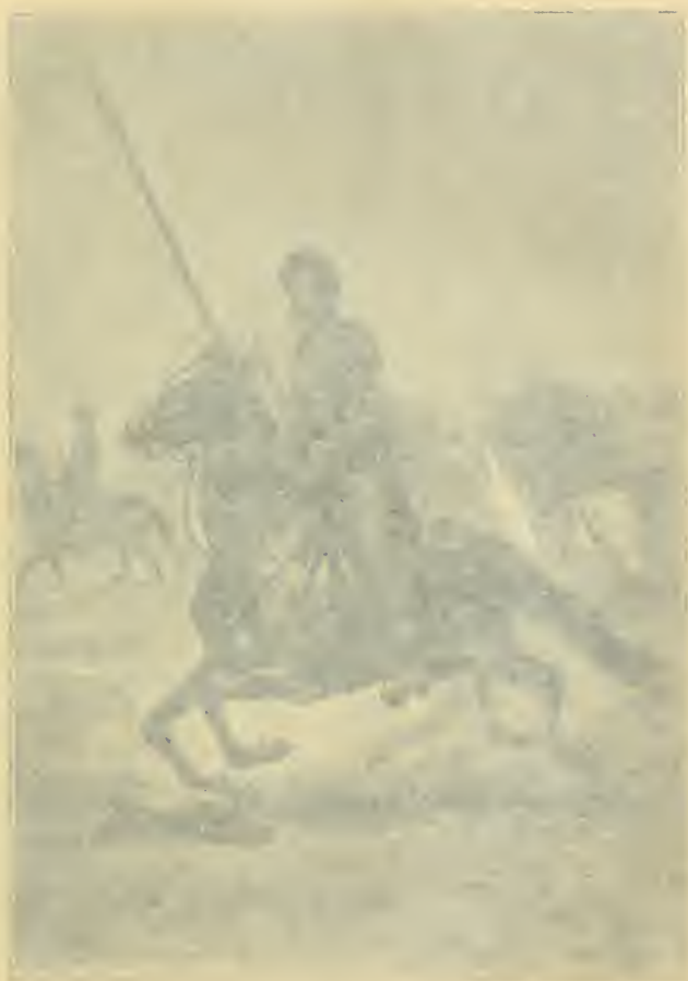
A Don Quixote L'illustration est de l'œuvre de l'artiste