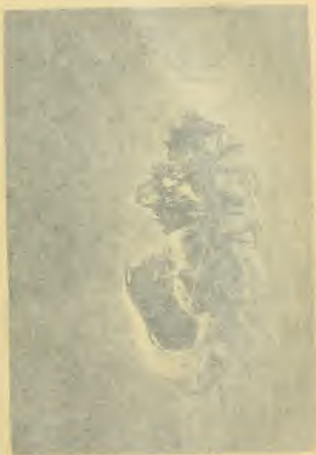
The Snow - Storm A photograph from Pointing by Giovanni