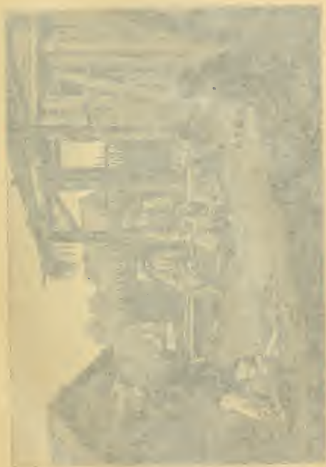
The Game of Skiffle The Game of Skiffle The Game of Skiffle