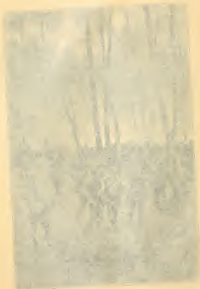
At the Front The Road through the Forest