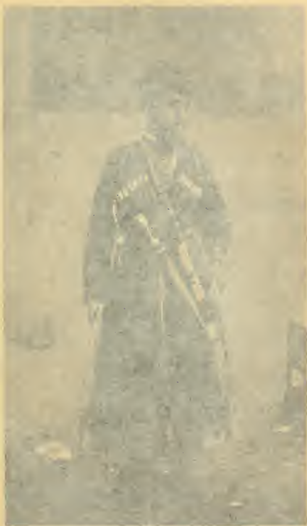
A Circassian Photograph from the