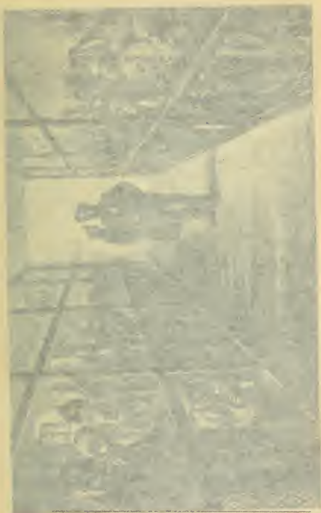
Visiting Day at the Prison Photograph from Prison by A. O. Whitehead