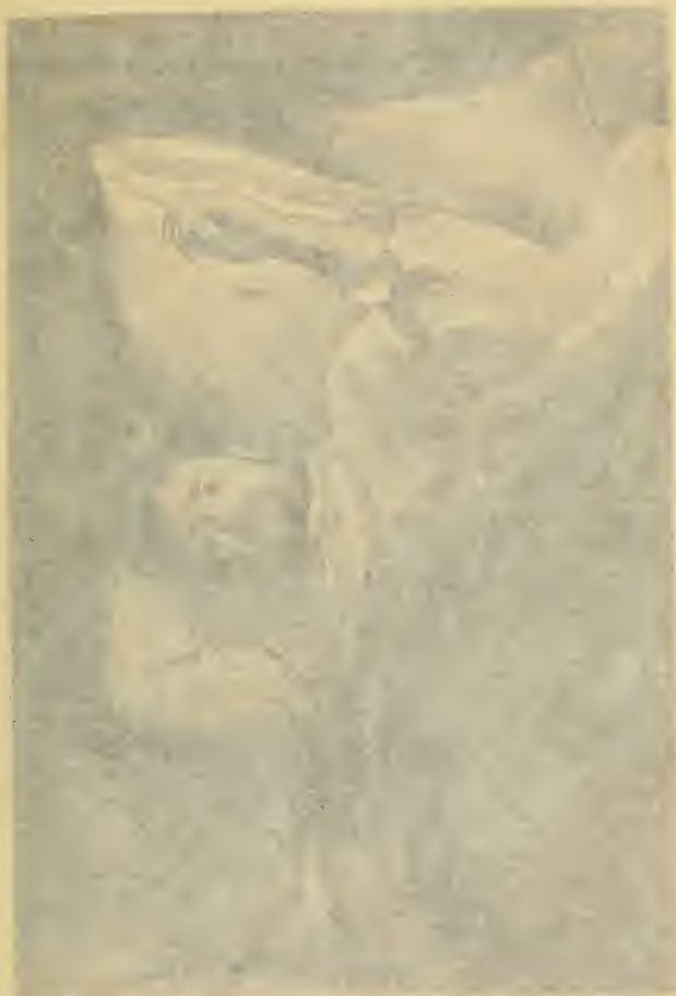
"Lying on his high, crumpled spring bed"