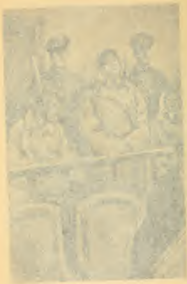
"Máslava started up" Photomontages from Painting by E. O. Edinová