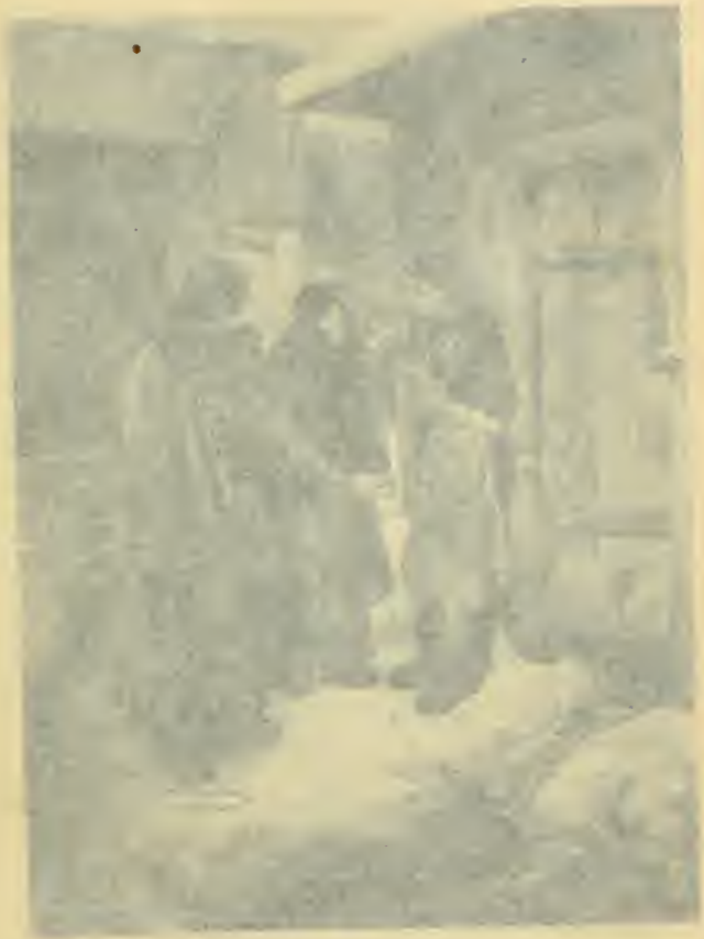
Visiting Their Son. Peasants Come to Town