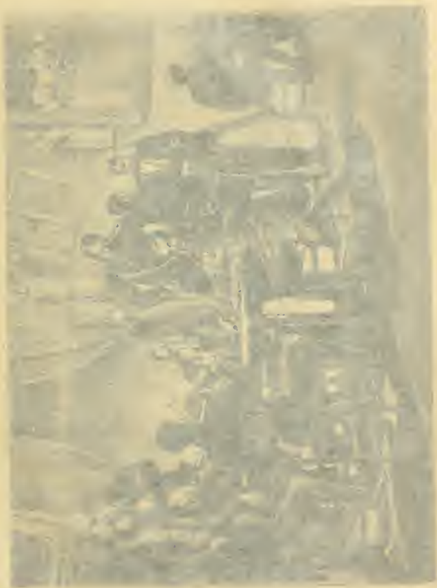
Amusements of the Rich Photograph from Drawing by Manin