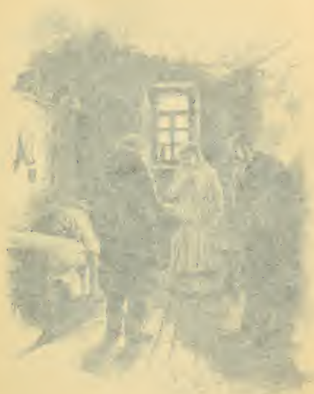
In the Lodging-house