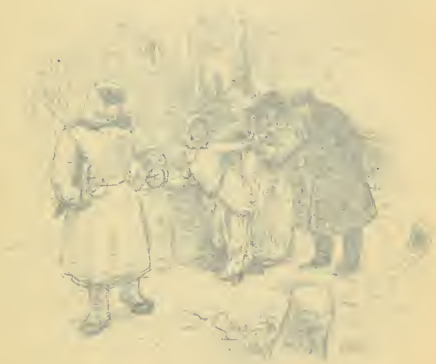
Questioning the Unfortunate Photograph from Drawing by A. E. Répin