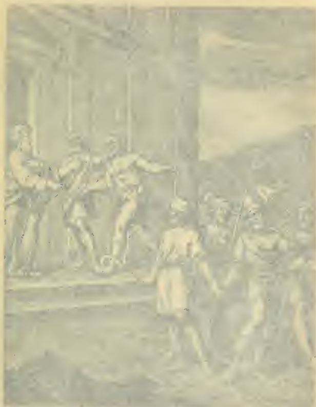
The Parable of the Vineyard From an Old Print