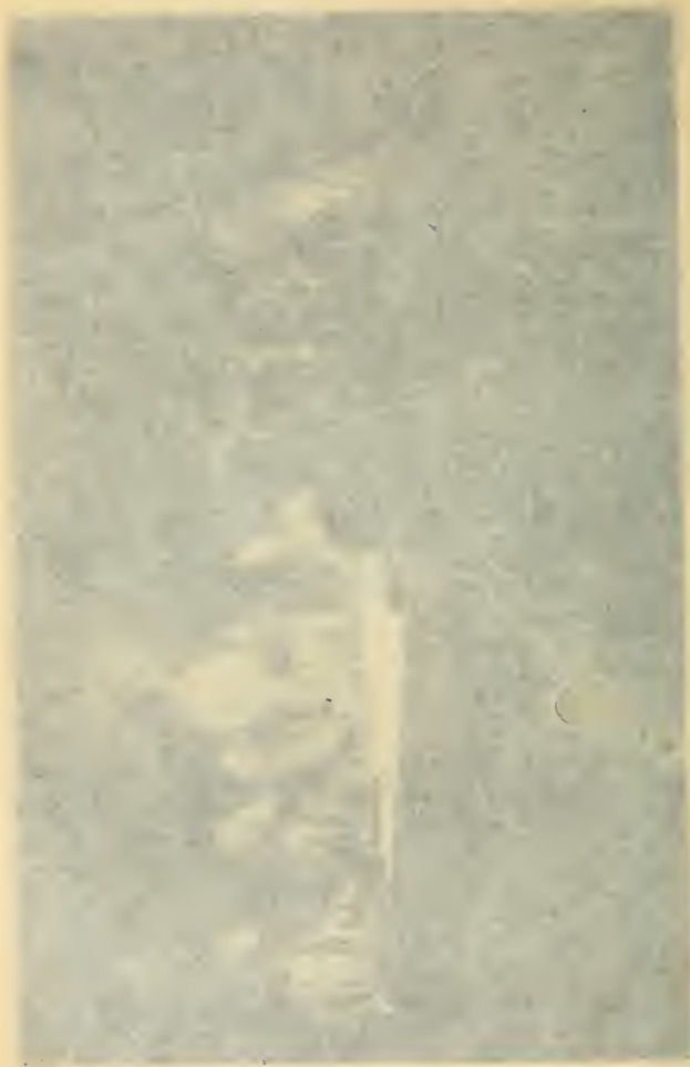
The Last Supper Manuscript from Florence, Italy, 1495