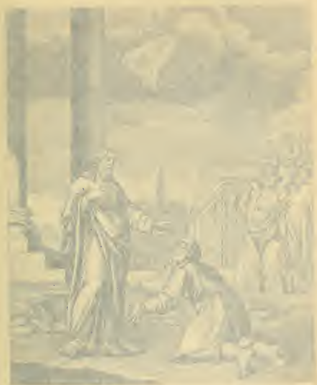
Jesus and the Man Born Blind Engraving from Jesus Our Lord