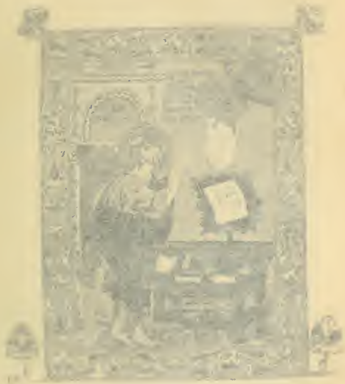
Photomont from Oldest Russian Gospel Saint Luke