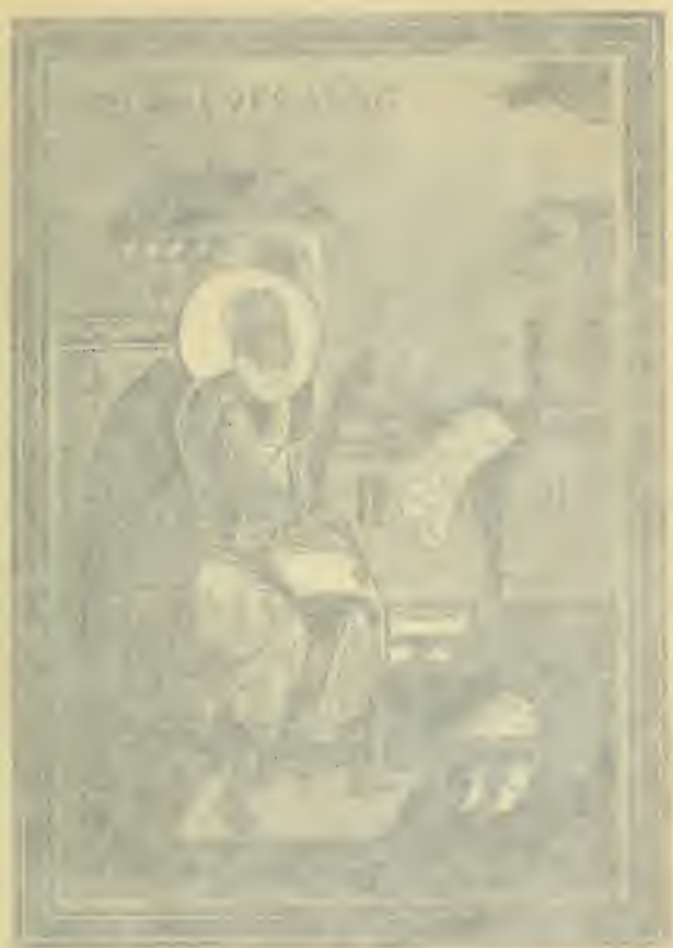
Saint John