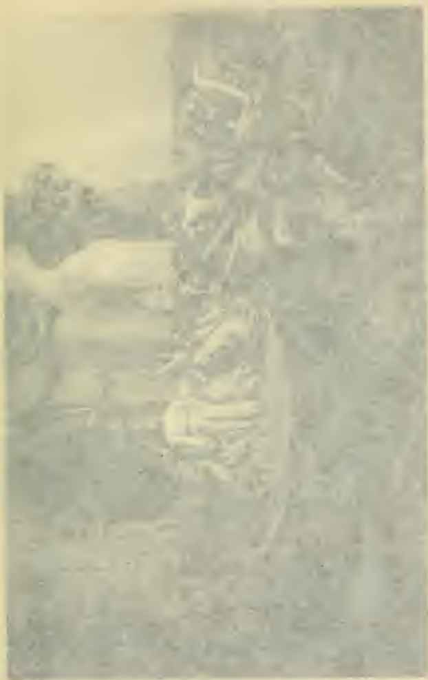
Christ Casting out the Money-changers The figures from Paintings by F. Kischbuck