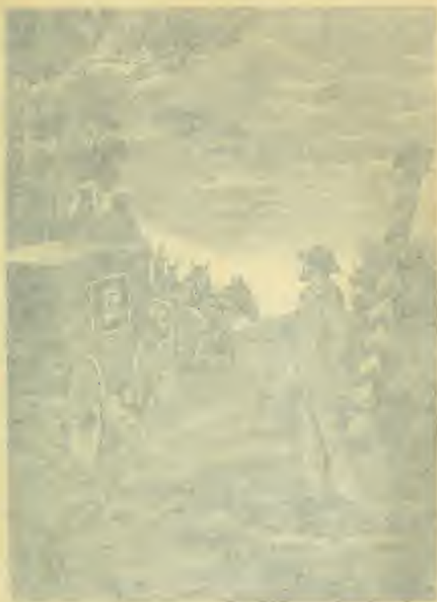
Meeting of Levin and Kitty Woodcut from Anna Karenina by I. Kramskoy