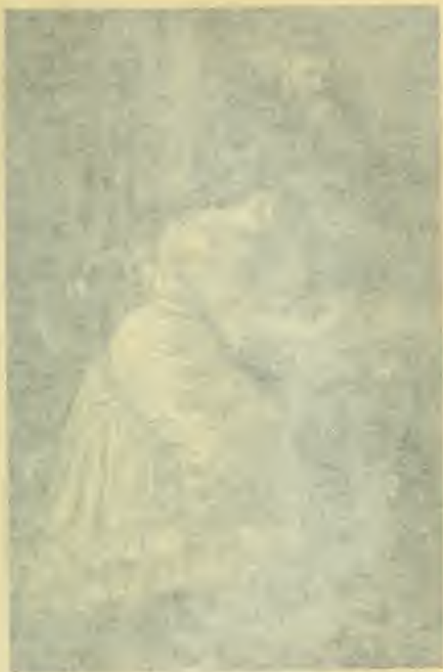
“I have made it out.”