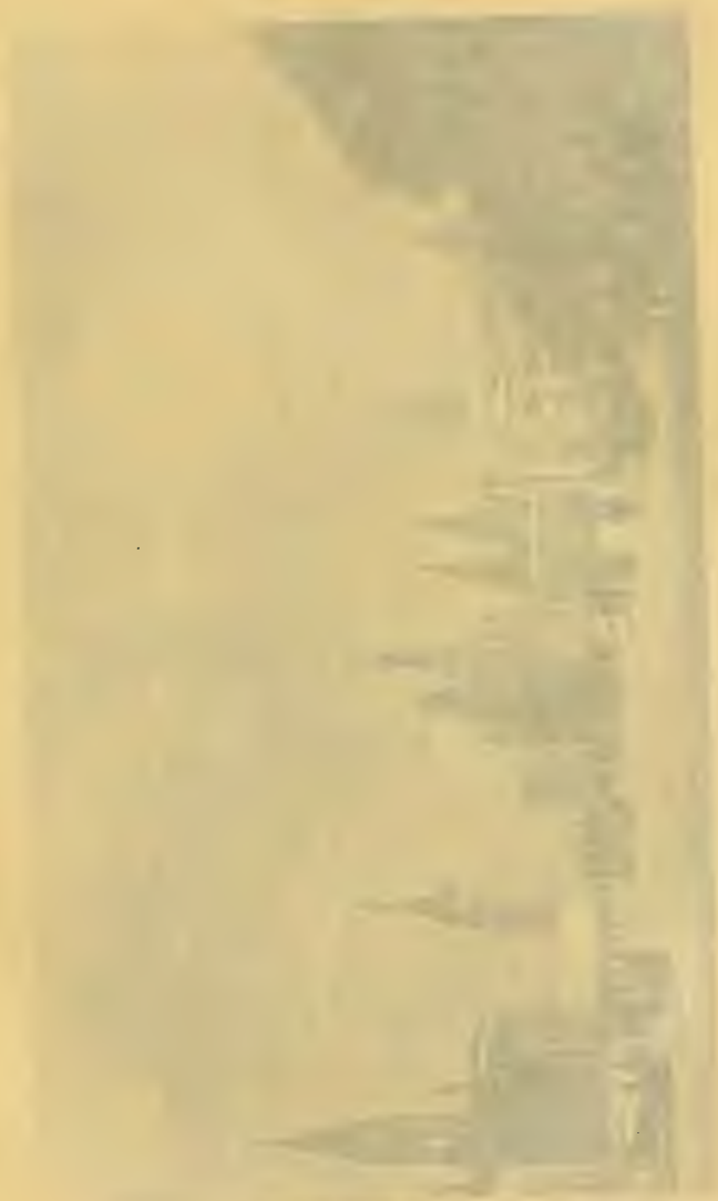
The Beautiful Spire, Florence Engraving from Albumen in Art