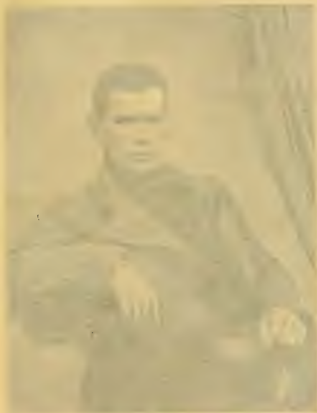
Portrait of a child in the year 1900