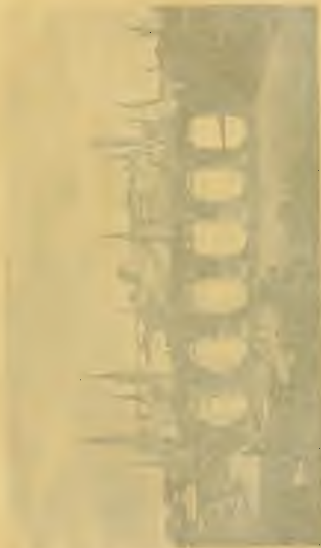
The Kremlin at Moscow in 1823 Landscape from Exposition de Paris