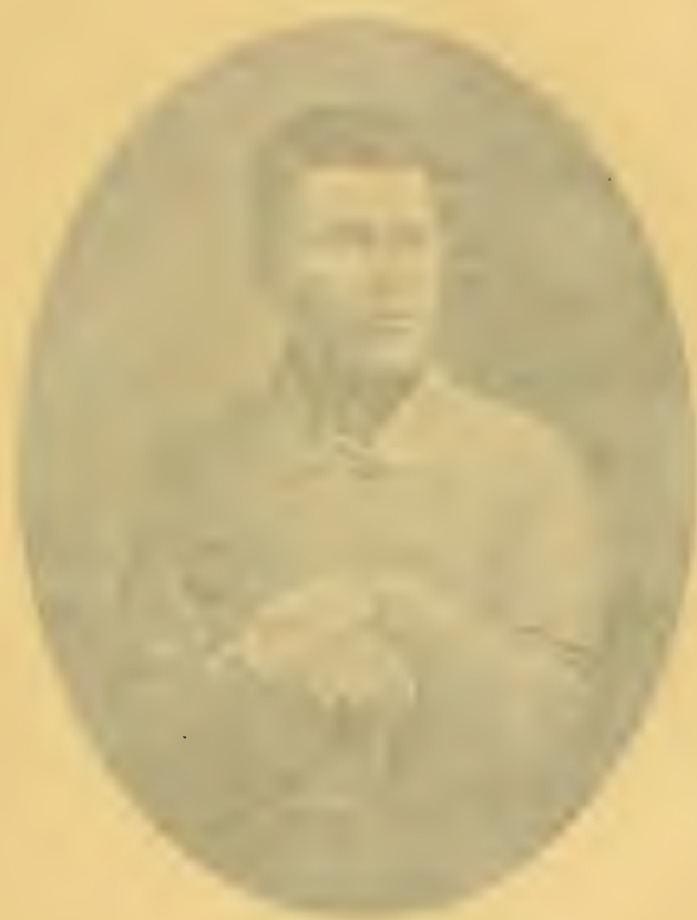
Portrait of General of the Army of 1861 General of the Army of 1861