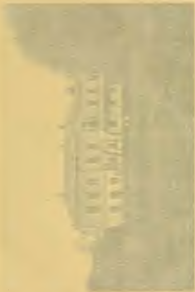
Tolbooth, County House at Edinburgh Edinburgh